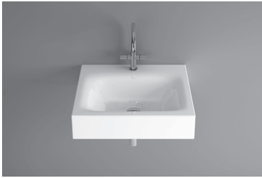
Design: Tesseraux + Partner